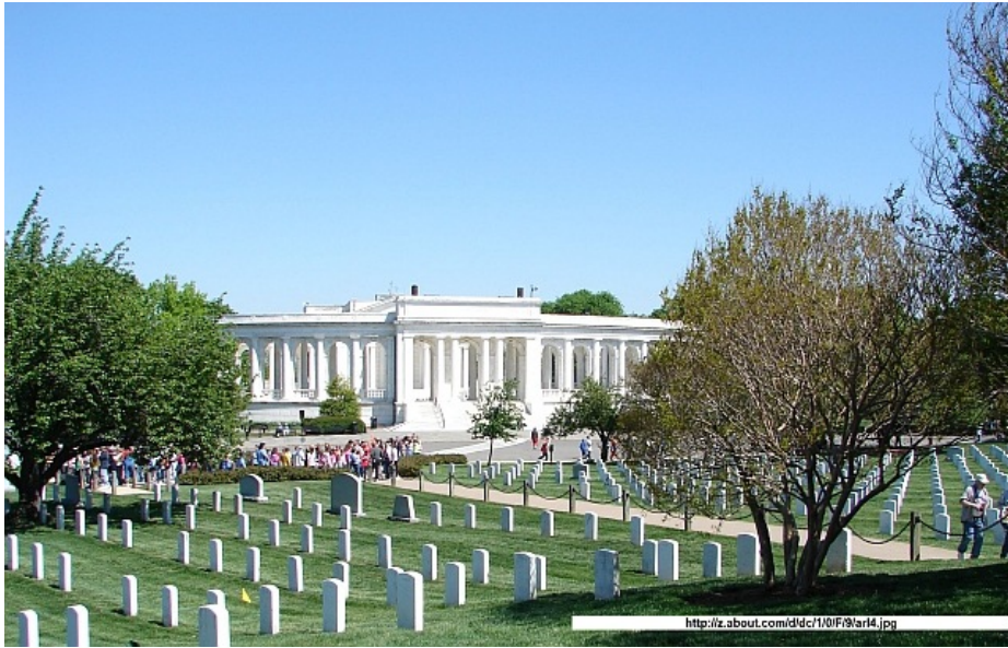
Memorial Amphitheater, Arlington, Virginia