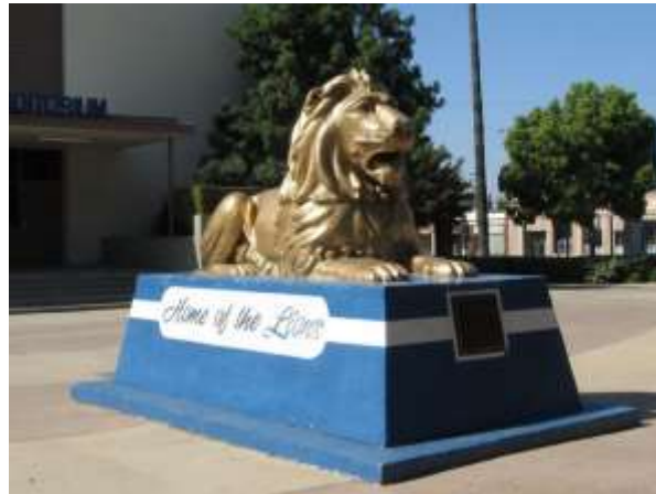
El Monte High School's Lion