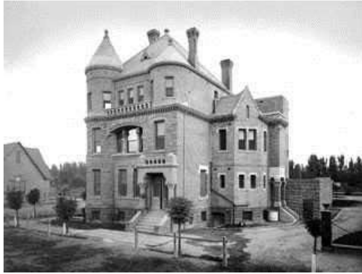
The Kern County Jail of 1894