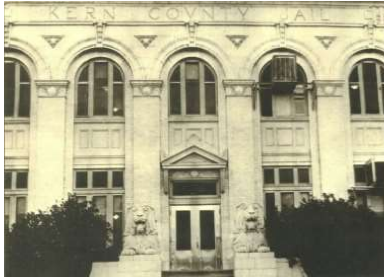
Kern County Jail, c. 1950-1960

maintained a sales office on Market Street in San Francisco, and the style and modeling of the statues correspond to the high-quality work of the company. 146 However, research into the Gladding-McBean connection came to an end after the company said it had no such lion molds in its collection. 147