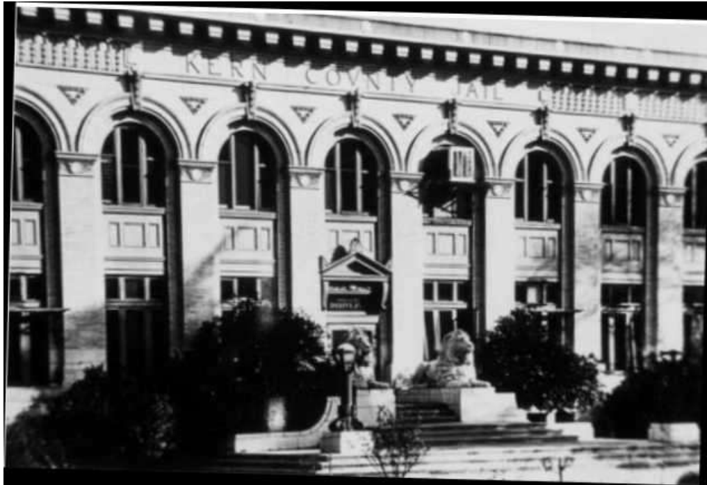
Kern County Jail built in 1913