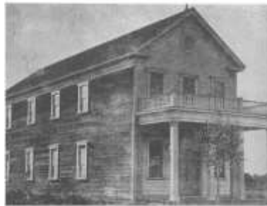
Bakersfield Town Hall